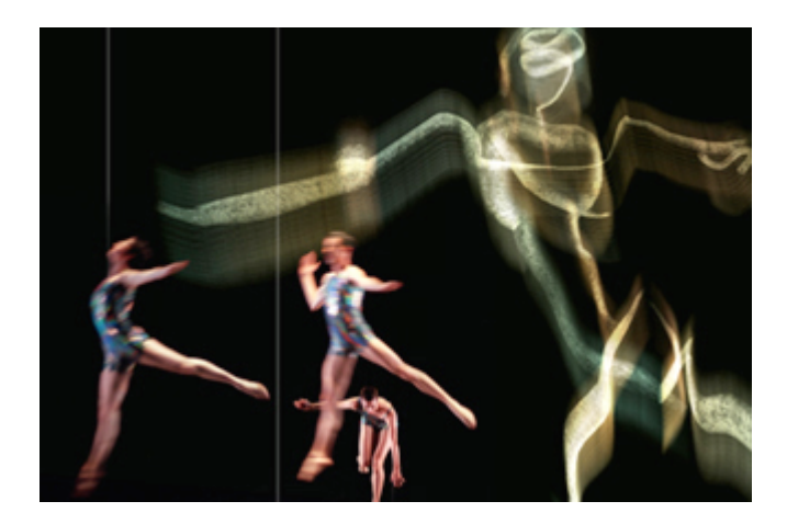
Fig. 3 Still image from BIPED, by Merce Cunningham in collaboration with Riverbed

Cunningham and long-term collaborators, Paul Kaiser and Shelley Eshkar, used Character Studio and another software module called Physique <sup>38</sup> - in conjunction with a motion tracking system - to record the movements of three dancers performing sequences choreographed by Cunningham (see fig.3).