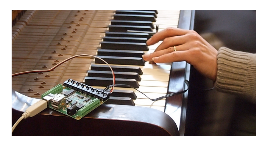
Fig. 1 Image from 'The Prosthetic Piano Party' project, Cambridge Anglia Ruskin University