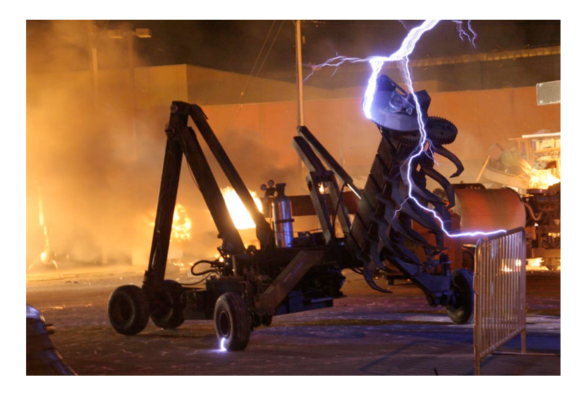
Fig. 4 Image of Inchworm taking a hit from the Tesla Coil<sup>43</sup>

In contrast to Pinhanez's virtual autonomous character, whose presence is manifest by the responsive nature of what appears on a screen and is emitted through speakers, the cacophonous and pyrotechnic productions of the Survival Research Laboratories (SRL)<sup>42</sup> are ritualized spectacles of robotic and mechanized interaction that create visceral environments filled with noise and smoke, redolent of conflict, warfare, destructive science and industrialization that has autonomously and irrationally gone beyond human control (see fig. 4). As pieces of cinematic-like spectacular drama, SRL's productions might be said to inhabit a space near the boundary of an artistic and dramatic territory that also encompasses less frenetic use of robotic 'characters'.