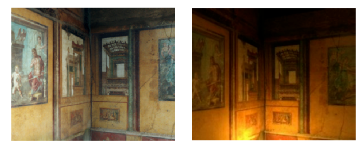
Fig. 6 House of the Vettii with simulated modern lighting (left) and olive oil lamp (right) - Kate Devlin et al

The use of MIDI show controllers (MSC's) for handling complex sequences of lighting, audio, pyrotechnics, scenery movements, atmospheric conditions, etc., has been commonplace in performance venues for many years. Like the MIDI music protocol, MSC's interface between devices that recognise commands to cue or end specific encoded instructions and as such, can potentially work with any piece of equipment that can accommodate MIDI input. Given their long history of use, it is perhaps more interesting in this context to focus on the use of lighting and special effects in virtual environments and the types of tools that designers can use to enhance these spaces. Radiance<sup>73</sup> is an example of an open source product that handles sophisticated virtual lighting schemes by calculating the amount of light passing through a specific point in a specific direction, a technique known as 'ray tracing'. Fig. 5 shows an example of the type of lighting simulation that can be produced and compares a corner of a room in the House of the Vettii in Pompeii as it might have appeared prior to 79 A.D. when it was highly likely that illumination would have been supplied by olive oil lamps. This is compared to lighting under modern conditions and the resultant effects on the visibility of the frescoes are discussed by Devlin et al in their report.<sup>74</sup>